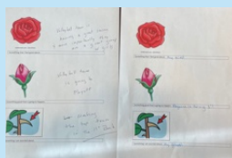
Rose, Bud, Thorn Activity