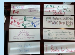
Bumper stickers Activity